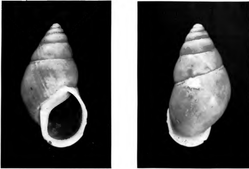
FIG. 11. Bulimulus (Rhabdotus) fonsecanus , new sp. CNHM No. 106702, type, front and back views; about \times 2 .

Relationships. —The species here described seems to be most closely related to Bulimulus (Rhabdotus) baileyi Dall from the Mexican state of Sonora. The fact that the new fonsecanus does not show any surface sculpture, as baileyi does, may be due to the fact that the type, the only specimen at hand, has been collected dead in a rather worn down state. However, there are characteristic differences between the two species: fonsecanus has seven whorls instead of the five to six in baileyi , and the shape of the aperture is different; in baileyi the ends of the peristome converge without a noticeable callus between them, while in fonsecanus the ends of the peristome do not approach each other and are united by a conspicuous callus.